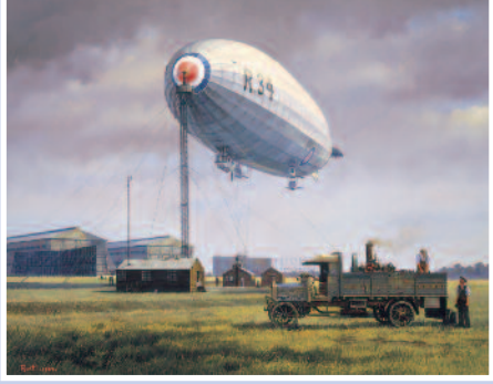
Pulham Leviathan, painted 1997